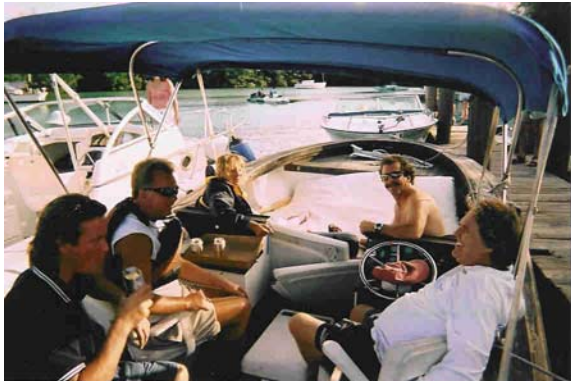
A Thirsty Motley Crew