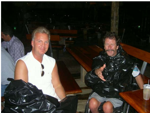
Now you see me...