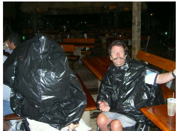
Now you don’t