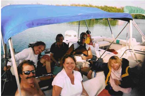
The Motley Crew