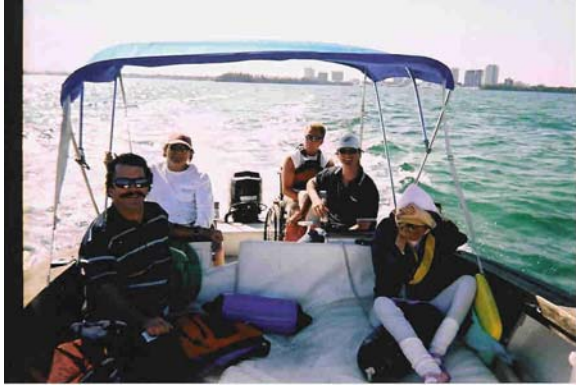
A boat ride to Jimbo's