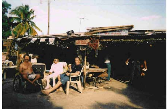
Smoked Fish at Jimbo's