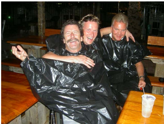
St. Patrick’s Day at Monty’s

There was a recent training camp held in Miami, Florida. Because of St. Patrick’s Day, the training camp focused more on social skills than on sailing skills. However, there were a few days that we shifted focus towards sailing. I hope you enjoy the photos. If nothing else, they are good fun and great for a laugh.