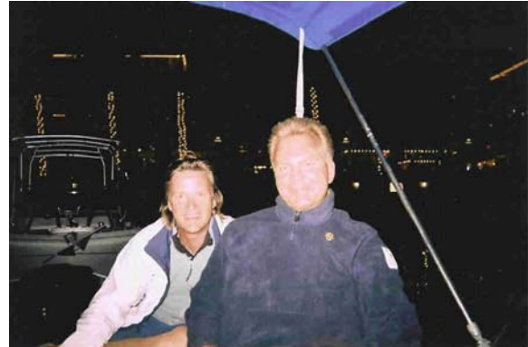
Los Dos Pepes