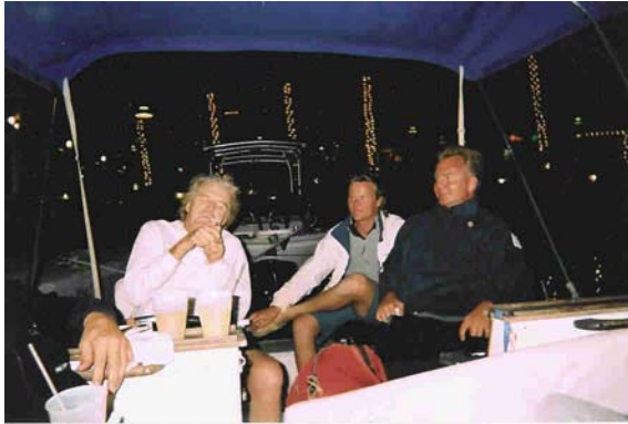
An Ultra Marlboro After Dinner at Bayside